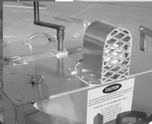
MANUALLY OPERATED AGITATOR AND MATERIAL TEMPERATURE INDICATOR

for raised pavement marker installation.