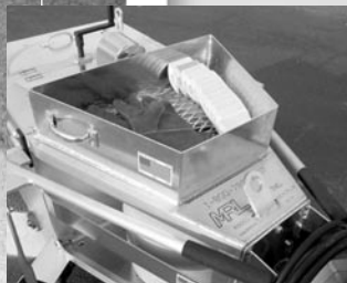
REMOVABLE RPM STORAGE BIN