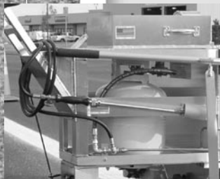
HAND TORCH ASSEMBLY WITH HOSE